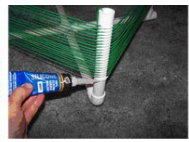
Winding the Coil on the PVC Frame The wire size and length recommendations in Table A have been tested in actual PVC loops, and should be followed for best results. In any case, wire should be stranded, insulated, single conductor, and of a size close to the wire recommended in Table A.